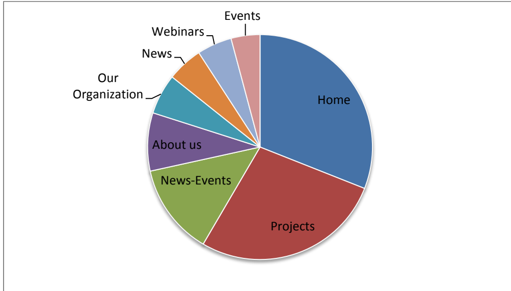
Pageviews (n = 21,000) for Most Visited Pages